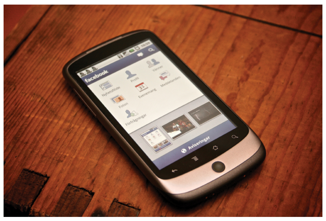
Figure 1.1 Do You Use Facebook? Economics is greatly impacted by how well information travels through society. Today, social media giants Twitter, Facebook, and Instagram are major forces on the information super highway.