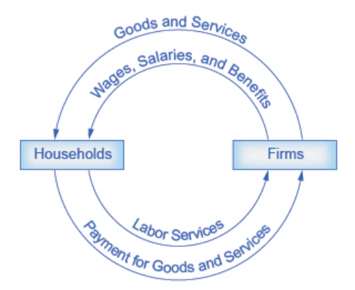
Figure 1.6 The Circular Flow Diagram The circular flow diagram shows how households and firms interact in the goods and services market, and in the labor market. The direction of the arrows shows that in the goods and services market, households receive goods and services and pay firms for them. In the labor market, households provide labor and receive payment from firms through wages, salaries, and benefits.

A good model to start with in economics is the circular flow diagram , which is shown in Figure 1.6 . It pictures the economy as consisting of two groups—households and firms—that interact in two markets: the goods and services market in which firms sell and households buy and the labor market in which households sell labor to business firms or other employees.