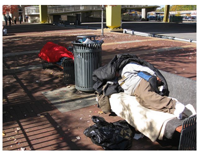
Figure 1.2 Scarcity of Resources Homeless people are a stark reminder that scarcity of resources is real.

If you still do not believe that scarcity is a problem, consider the following: Does everyone need food to eat? Does everyone need a decent place to live? Does everyone have access to healthcare? In every country in the world, there are people who are hungry, homeless (for example, those who call park benches their beds, as shown in Figure 1.2 ), and in need of healthcare, just to focus on a few critical goods and services. Why is this the case? It is because of scarcity. Let's delve into the concept of scarcity a little deeper, because it is crucial to understanding economics.