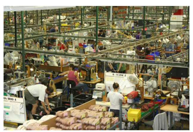
Figure 1.4 Division of Labor Workers on an assembly line are an example of the divisions of labor.

Modern businesses divide tasks as well. Even a relatively simple business like a restaurant divides up the task of serving meals into a range of jobs like top chef, sous chefs, less-skilled kitchen help, servers to wait on the tables, a greeter at the door, janitors to clean up, and a business manager to handle paychecks and bills—not to mention the economic connections a restaurant has with suppliers of food, furniture, kitchen equipment, and the building where it is located. A complex business like a large manufacturing factory, such as the shoe factory shown in Figure 1.4 , or a hospital can have hundreds of job classifications.