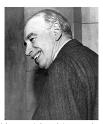
Figure 1.5 John Maynard Keynes One of the most influential economists in modern times was John Maynard Keynes.

John Maynard Keynes (1883–1946), one of the greatest economists of the twentieth century, pointed out that economics is not just a subject area but also a way of thinking. Keynes, shown in Figure 1.5 , famously wrote in the introduction to a fellow economist's book: "[Economics] is a method rather than a doctrine, an apparatus of the mind, a technique of thinking, which helps its possessor to draw correct conclusions." In other words, economics teaches you how to think, not what to think.