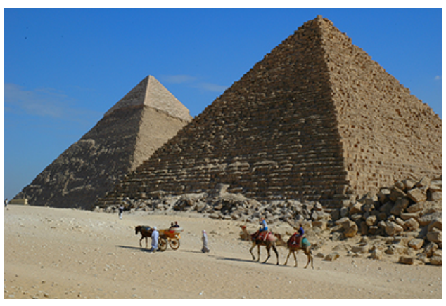
Figure 1.7 A Command Economy Ancient Egypt was an example of a command economy.

Command economies are very different. In a command economy , economic effort is devoted to goals passed down from a ruler or ruling class. Ancient Egypt was a good example: a large part of economic life was devoted to building pyramids, like those shown in Figure 1.7 , for the pharaohs. Medieval manor life is another example: the lord provided the land for growing crops and protection in the event of war. In return, vassals provided labor and soldiers to do the lord's bidding. In the last century, communism emphasized command economies.